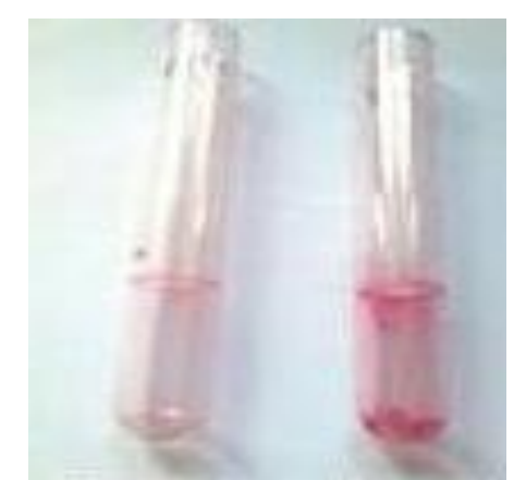
Fig 3:- Biofilm formation by Candida species (Tube method)

A loopful of organisms from the surface of SDA plate was inoculated into tube containing 10ml of Sabouraud Dextrose Broth supplemented with glucose. The tubes were incubated at 35°C for 48hours. After incubation, the culture supernatants were decanted and the tubes were washed with phosphate buffer saline (pH 7.3) and the dried tubes were stained with 1% Safranin. Excess stain was removed by washing with de-ionized water. Tubes were then dried by positioning them invertedly. Tubes were then observed for biofilm formation. Biofilm formation was considered positive when a visible film lined the wall of the test tube.