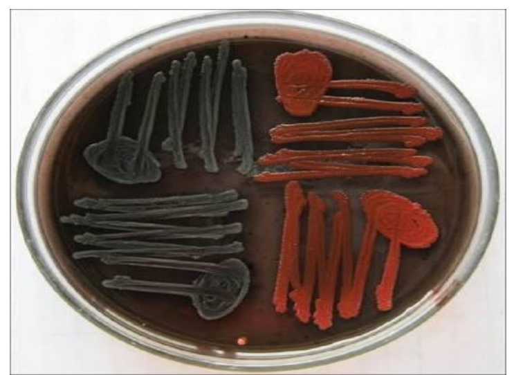
Fig 2:- Biofilm formation by Candida species (Congo Red Agar)

Congo Red Agar (CRA) is a simple and qualitative method for detecting biofilm production described by Freeman et al using Congo Red Agar medium. CRA medium was prepared with brain heart infusion broth 37 g/L, sucrose 50 g/L, agar No. 1 10 g/L and Congo Red indicator 8 g/L. Firstly Congo red stain was prepared as a concentrated aqueous solution separately from the other medium constituents and autoclaved at (121^{\circ}C \text{ for } 15 \text{ minutes}) and then added to the autoclaved brain heart infusion agar with sucrose which is cooled at 55 °C. CRA plates were inoculated with test organisms and incubated at 37 °C for 24 hr aerobically. Black colonies with a dry crystalline consistency will indicate biofilm production. The experiment was performed in triplicate and repeated three times.