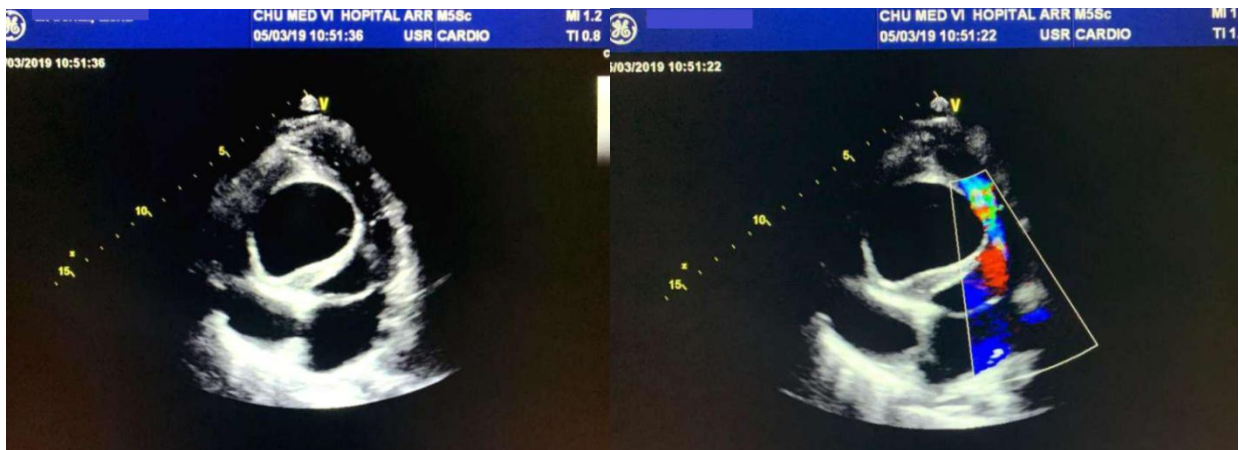
Figure 1-2:- Echocardiographic examination ( Apical four chamber view)shows the hydatid cyst in interventricular septum.

The cavity was closed by obliteration and plication. Albendazole was started at 200 mg twice a day in 3 cycles of treatment for 28 days with a break of 14 days. The postoperative course was satisfactory, and the patient was discharged on the 5th postoperative day without any complication.