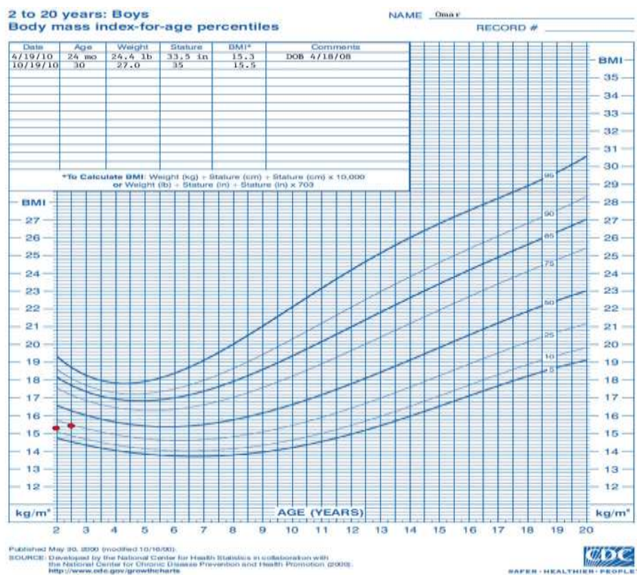
Figure 1:- Body mass index (BMI)-for-age profiles for boys and men (47) .