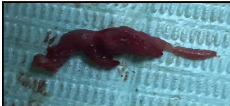
Figure 1:- The main part of the enucleated cyst.

A large periapical defect (3x2x1.5 cm) resulted with relation to the apices of lower incisors and lower left canine. Complete curettage done and walls of the defect stimulated by round bur to produce bleeding.