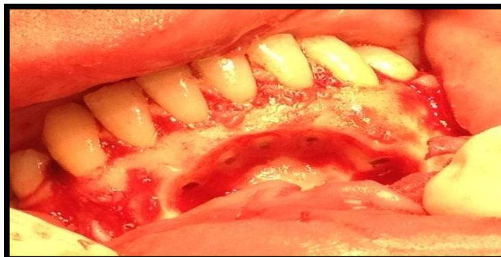
Figure 2:- Surgical enucleation with curettage, and apicoectomy with retrograde filling of the offending teeth A Collagen membrane, was placed to cover the boundaries of the defect. The membrane was secured in position lingually and apically by sutures to the overlying flap [Figure 3]. The flap was repositioned and sutured with 3-0 vicryl suture material.