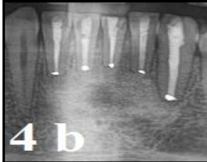
Figure 4:- a- A 9 months post-operative panoramic xray, b- Cropped image from the panorama, which showed complete bony healing as indicated by increase in radiodensity.