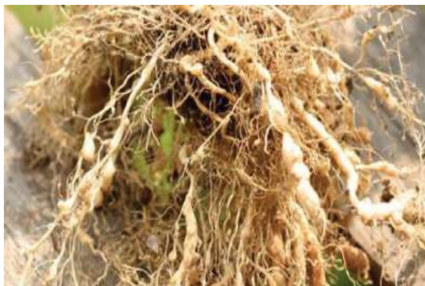
Figure 2:- Cleaned Pomegranate roots ( Punica granatum ).

Punica granatum Linn (family Punicaceae) commonly known as pomegranate is easily available and widely spread plant in the world. It is widely cultivated throughout Mediterranean region and all tropical regions including temperate, tropical and subtropical regions due to its higher commercial scale (Stover, 2007). Due to its health effects, it is widely used in the universe. According to Ayurveda, as all parts of Punica granatum has active chemical constituent, it's all parts has medicinal value. Juice of the pomegranate is used as diuretic activity and cooling effect. It is also used to improve vitamin A level, as antipyretic and mineral supplement (Thangavelu, 2017). Its bark decoction acts against piles bleeding, leaves can be used for threatened abortion, flower buds can be used for nasal bleeding, fruit rind is recommended for gum and teeth bleeding, seed powder is effective in dissolving renal calculi (DeFilipps, 2018). Other beneficial medicinal activities of various parts of Punica granatum are immunomodulatory, anti-inflammatory, antidiabetic, anticancer, to treat conjunctivitis etc (Jahromi, 2018).