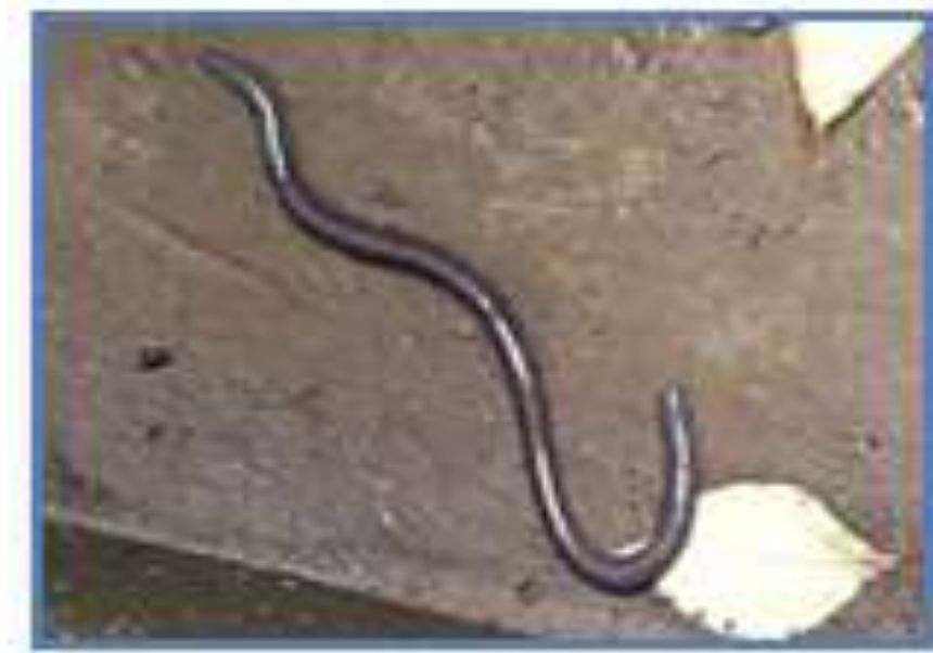
Figure 1:- Earthworm ( Pheretima posthuma ).

Punica granatum Linn (family Punicaceae) commonly known as pomegranate is easily available and widely spread plant in the world. It is widely cultivated throughout Mediterranean region and all tropical regions including temperate, tropical and subtropical regions due to its higher commercial scale (Stover, 2007). Due to its health effects, it is widely used in the universe. According to Ayurveda, as all parts of Punica granatum has active chemical constituent, it's all parts has medicinal value. Juice of the pomegranate is used as diuretic activity and cooling effect. It is also used to improve vitamin A level, as antipyretic and mineral supplement (Thangavelu, 2017). Its bark decoction acts against piles bleeding, leaves can be used for threatened abortion, flower buds can be used for nasal bleeding, fruit rind is recommended for gum and teeth bleeding, seed powder is effective in dissolving renal calculi (DeFilipps, 2018). Other beneficial medicinal activities of various parts of Punica granatum are immunomodulatory, anti-inflammatory, antidiabetic, anticancer, to treat conjunctivitis etc (Jahromi, 2018).