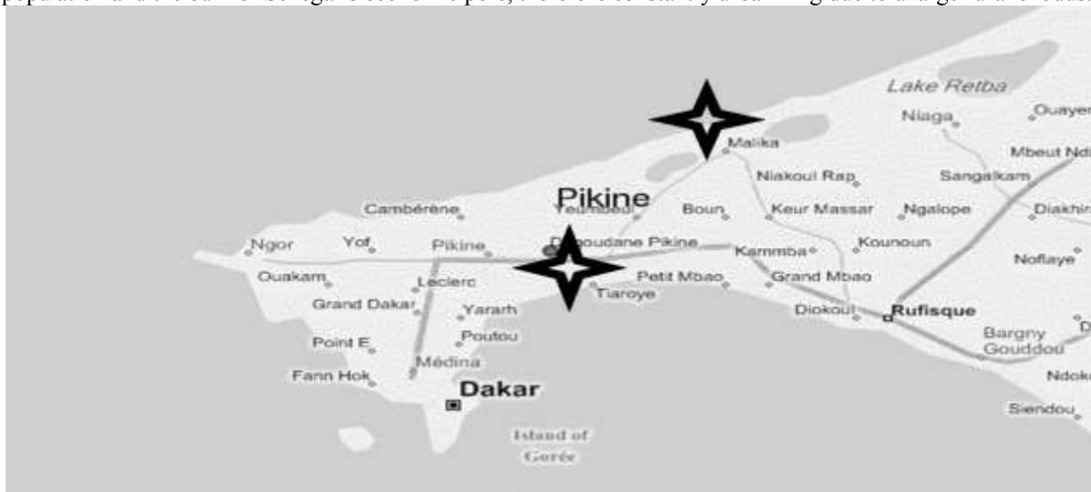
Fig 1:- Study area map. The two studied districts of Dakar are highlighted on the map. ( https://www.weather-forecast.com/locations/Pikine/forecasts/latest ). 15 June 2020.

A cross-sectional study was conducted from August 2011 to February 2012 in two of the most visited health centers of Dakar, Senegal's capital. These are the health posts Albert Ngor NDOUR (ANN) of Thiaroye and Malika, chosen randomly for this study (figure 1). This region has been chosen because it accounted for about 25% of the total population and the bulk of Senegal's economic pole, therefore constantly urbanizing due to a large rural exodus.