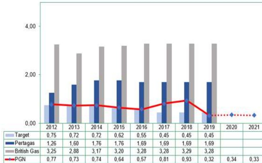
Fig. 1:- The EBITDA of PGN and its Competitors.

From the graph in Figure 1, it can be seen that PGN has not shown optimal employee productivity so far, even has a downward trend. The decline in productivity is thought to be caused by external factors, in the form of a decline in gas supply which has decreased and intense competition has resulted in decreased sales, with a decrease in worker productivity as the source. Apart from being caused by these external factors, the decrease in the measure of worker productivity is thought to be caused by the low productivity of managers, which affects the performance of all employees who are subordinate to them.