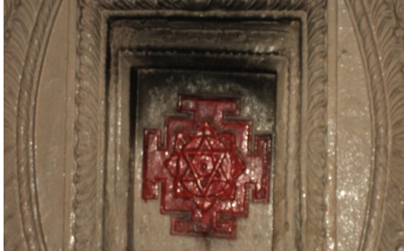
Mandala in Sankatha Devi Mandir, Varanasi premises since times immemorial.

In the Hindu culture it is believed that one should gain knowledge by reading all the holy scriptures i.e. the Vedas Or benefit from their teachings by cramming few mantras meaning that the essence of the whole of the sacred Vedas may be packed in a single powerful mantra Or the whole of the assemblage of all the Gods can be evoked in a single multi-armed deity Or the whole of the universe in a compact form may be depicted in the "Sacred Circle" of a cosmic map called a Mandala .