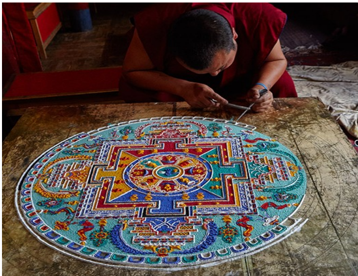
Mandala in Buddhist culture.