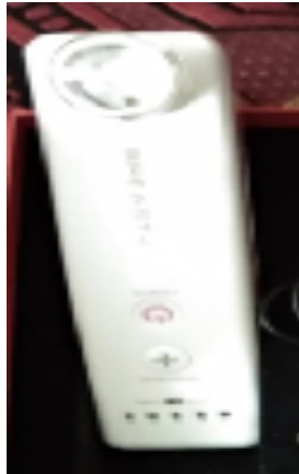
Fig.1:- BREAST-i LED machine Probe.

represent the suspicion of any breast lesion like adenoma or malignant tumour ( Figure No. 3 ).The privacy of participant was maintained adequately.The overall duration of interview and clinical examination was 10-15minutes per participant. At the end of the interview and examinations, results of examination were revealed to participants and if required prompt referral was provided to secondary level hospital for further investigations. Opportunity was also utilised for educating women on Breast Self examination. The descriptive analysis was done using SPSS software version 20 and data was presented in the form of tables.