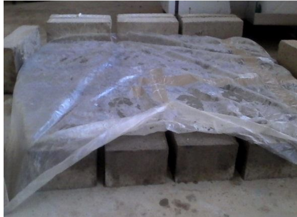
Figure 1:- Conservation and curing of Stabilized Earth Block (SEB)bricks.

To the three different proportions retained (M1, M3 and M4) for the preparation of the geoconcrete will be added 8%, 10% or 15% of cement for the formulation of the earth concrete and the manufacture of 9 classes of BTS in order to ensure repeatability and to cover the different tests. Thus, twelve (12) bricks were made per class using the manual brick press (see Fig. 2.a). These one hundred and eight (108) SEB bricks were put to dry in the shade, covered with plastic (see Fig.1) for 28 days in order to avoid shrinkage and cracking and to maximize cement crystallization.