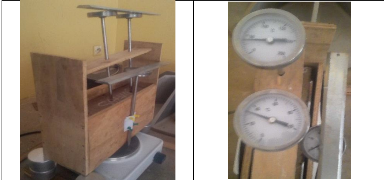
Figure 6:- Device for determining thermal conductivity.