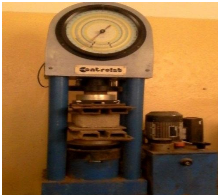
Figure 5:- Controlab press for the crushing test.