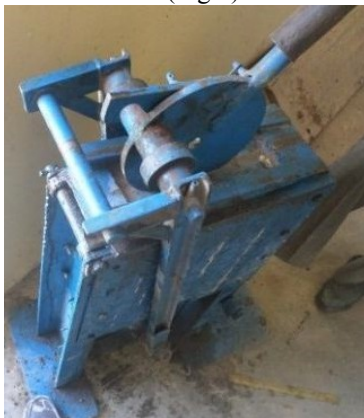
a) Manual press