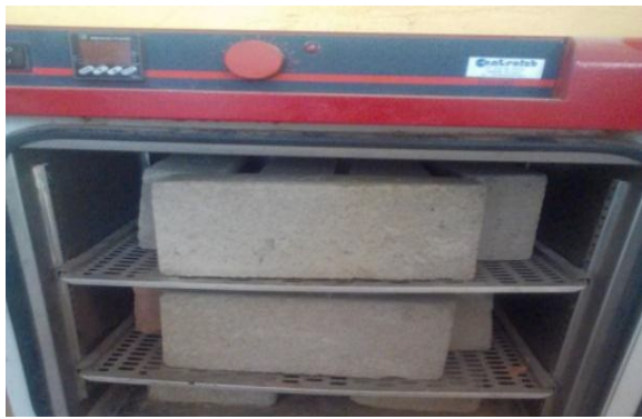
a) Oven for drying