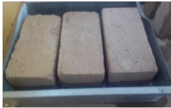
b) Immersion tank