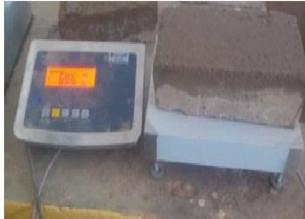
Figure 3:- Digital scale for weighing SEB bricks.