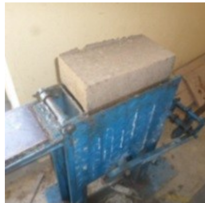
b) Moulded and ejected brick