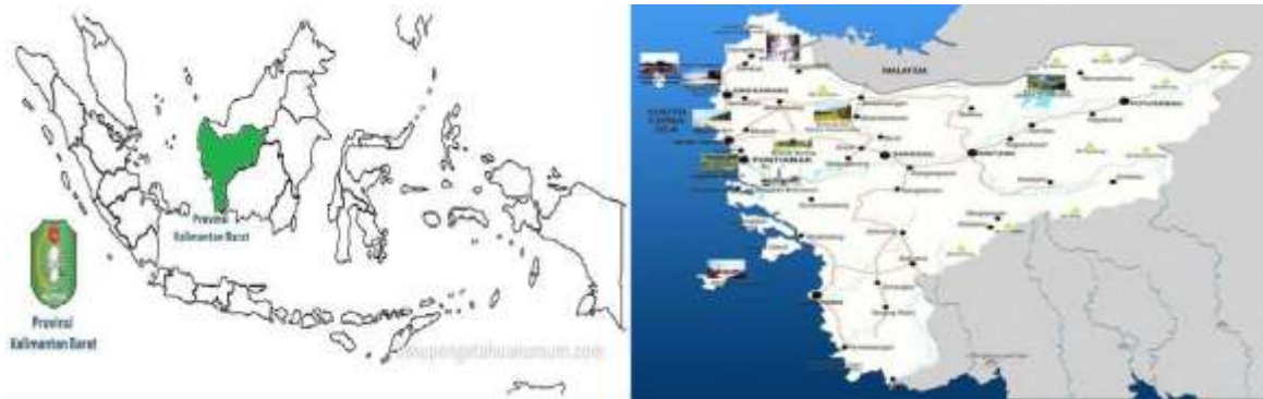
Figure 1:- Map of West Kalimantan Province

Thus, it is intriguing to question "How is the Security Measure on the Land Border of West Kalimantan?" In order to provide the explanation to the inquiry, a research on Security Measure on the Land Border of West Kalimantan to prevent the boundary violation in the land border of the Unitary State of the Republic of Indonesia in West Kalimantan and it involves: i) how the phenomena of boundary violation threat happening in West Kalimantan; ii) how the Security Measure on the Land Border of West Kalimantan is being carried out; and iii) how the strategy to improve the security of the land border in West Kalimantan is executed.