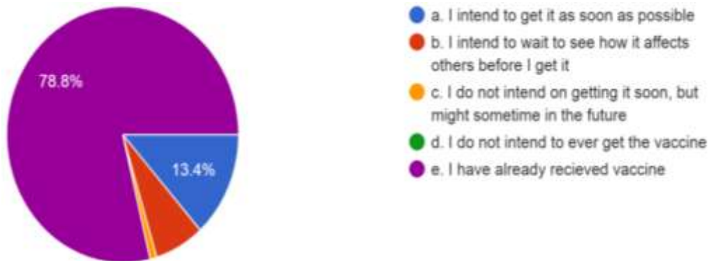
Fig 2:- A coronavirus (COVID-19) vaccine is available to you.