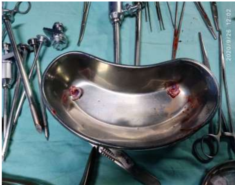
Fig 4:- Specimen Showig Sreak Gonads Which Were Removed.