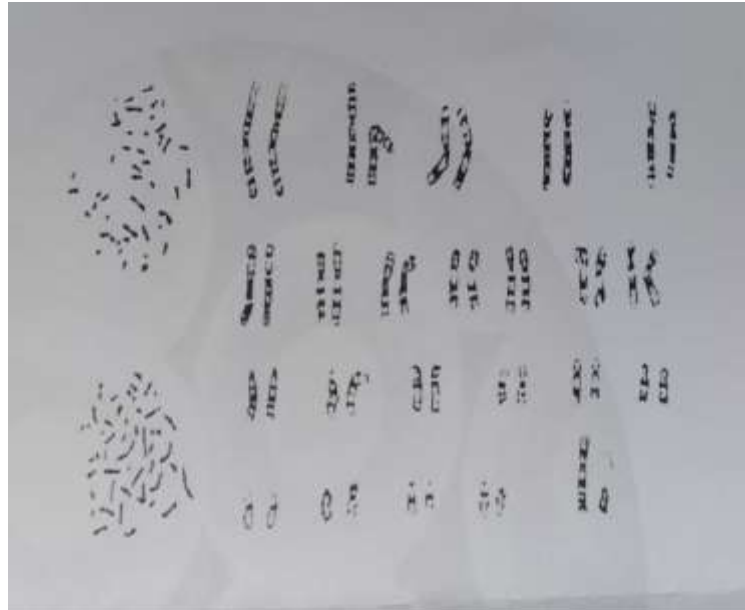
Fig 3:- Karyotype Of The Patient Revealing Male Genotype - 46XY.