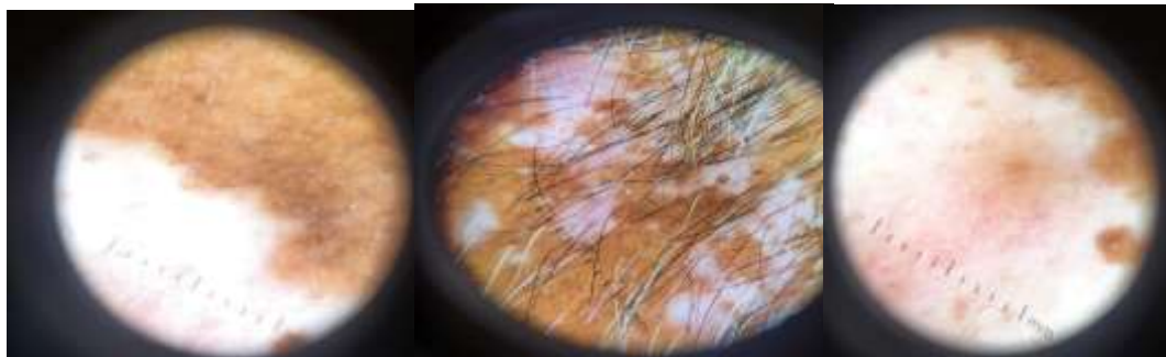
Figure:- 1 a

According to the basic guidelines, milky white is the background color, scales are absent in the lesion, different shades of pigmentation are the pigment pattern, no vascular structures are noted[figure-1c], and white hairs, if present in leukotrichia in vitiligo patch, are the follicular changes 2 . ”White glow” forms a special clue in vitiligo as it is not seen in other depigmentary lesions except in idiopathic guttate hypomelanosis (IGH).