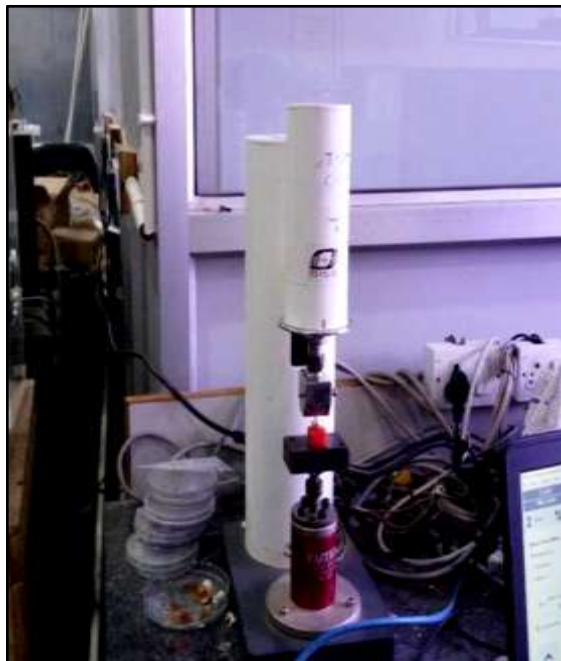
Figure 2: Specimen mounted in Universal Testing Machine for fracture resistance testing.