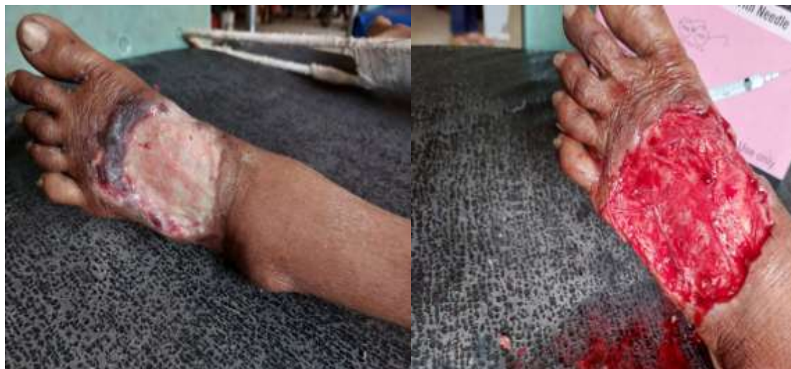
Fig: Day 0 and Day 19 of NSD diabetic foot wound