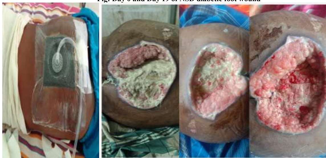
Fig: NPWT over the sacrum and Day 0, Day 5 and Day 11 after NPWT