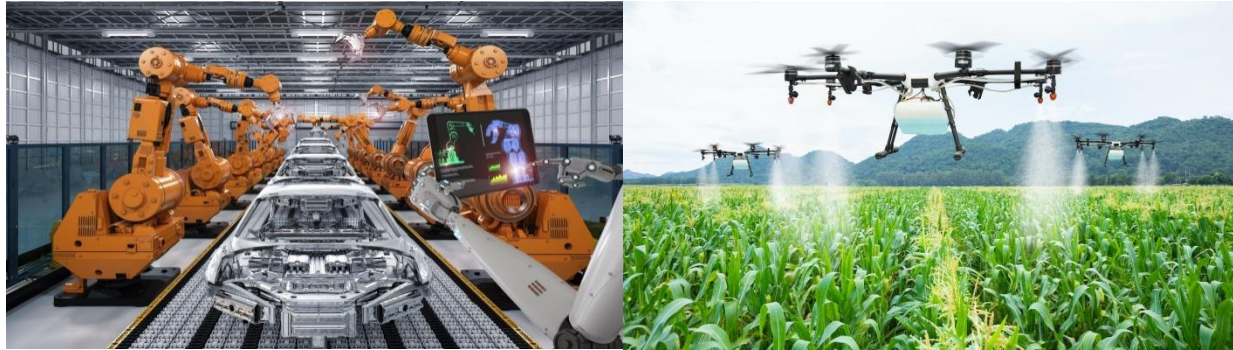
Figure 5: AI is a game-changer in the manufacturing industry [73], and AI will boost the agriculture sector [74]

concerns about job losses and increasing inequality. Even in wealthy nations, this is a common issue. Because their worldwide competitive advantage rests on the availability of large quantities of natural resources and labor, developing countries and emerging market economies have every reason to be more worried than high-income countries. In a world that is both labor-intensive and quickly globalizing, there is a risk of even further loss of control due to the winner-take-all dynamics brought about by new communication technologies and the falling returns on natural resources and labor. This might derail the tremendous development of the last half-century. On top of that, it might make it harder for communities all around the world to overcome poverty and injustice.