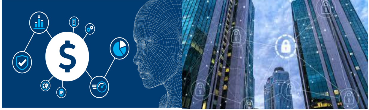
Figure 6: Cyber and network security [80] and AI will change the whole finance sector [81]

In 21 st century AI has the potential to be both knowledge-driven and data-driven. Knowledge inference and its application to all settings are the next-generation Artificial intelligence innovation. The emergence of new fields of research and the extension of present standards to facilitate future networks may be a consequence of numerous critical problems with machine learning in 5G and future networks [84]. Therefore, in order for AI to be implemented by a significant number of individuals and to improve, a robust security guarantee is required. Given that AI will be implemented in the transportation and healthcare sectors in the years ahead, it must be presented in manner that fosters trust and comprehension, as well as safeguards human and civil rights [85].