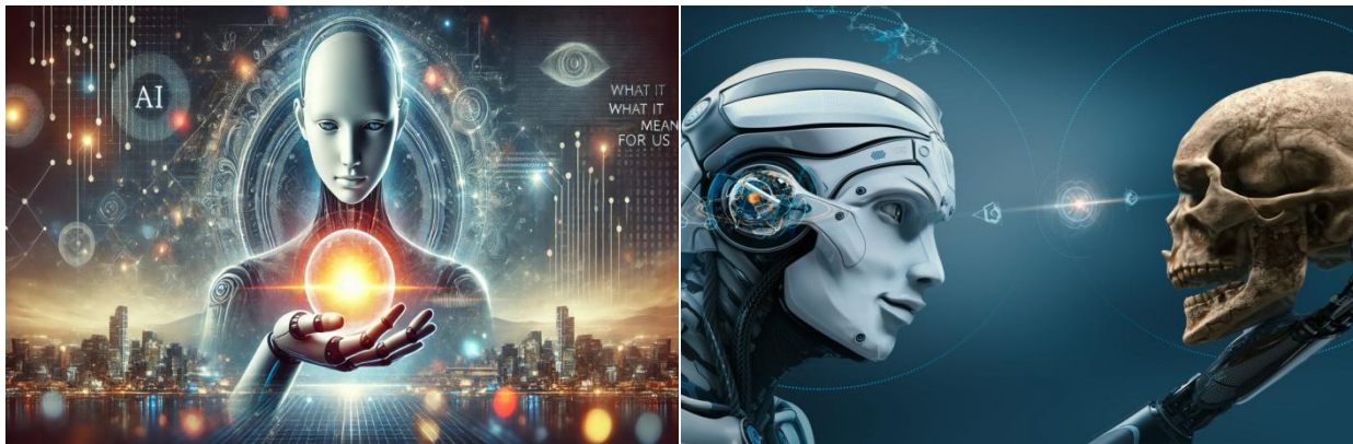
Figure 7: AI-Singularity [82], and that could destroy the earth [83]

Conversely, policies and procedures ought to address privacy, security, and ethical considerations. Consequently, global communities should collaborate to advance AI in a manner that is advantageous to mankind. It appears to be more unlikely that all human jobs would be destroyed as AI is increasingly integrated into the workforce. Rather, a significant number of experts anticipate that the workforce will grow more specialized in the future. These vocations will require a greater degree of what automation is now incapable of providing, including qualitative abilities, problem-solving, and creativity. In essence, the sector will always require personnel; but, their obligations may evolve as technology progresses. A greater number of these occupations will need a more advanced technical skill set, and some skill sets will be more in demand.