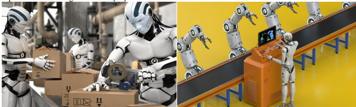
Figure 3: In future robots will work with human [62] and technological revolution [63]

The widespread influence of AI-powered contemporary technology is changing the world in fundamental ways, and as a result, ideas like 'post-work' are starting to shape our era. Because information technology (IT) is now the main driver, the skills needed in this period are very different from those in the Third Industrial Revolution. The artificial intelligence and other smart technologies industries are projected to reach a value of fifteen trillion dollars in the US during the next seven years. There will be mass layoffs of those who have had conventional schooling but lack the necessary abilities [60]. Conversely, the next few years will see the establishment of millions of positions that require modern and high-tech skills [61].