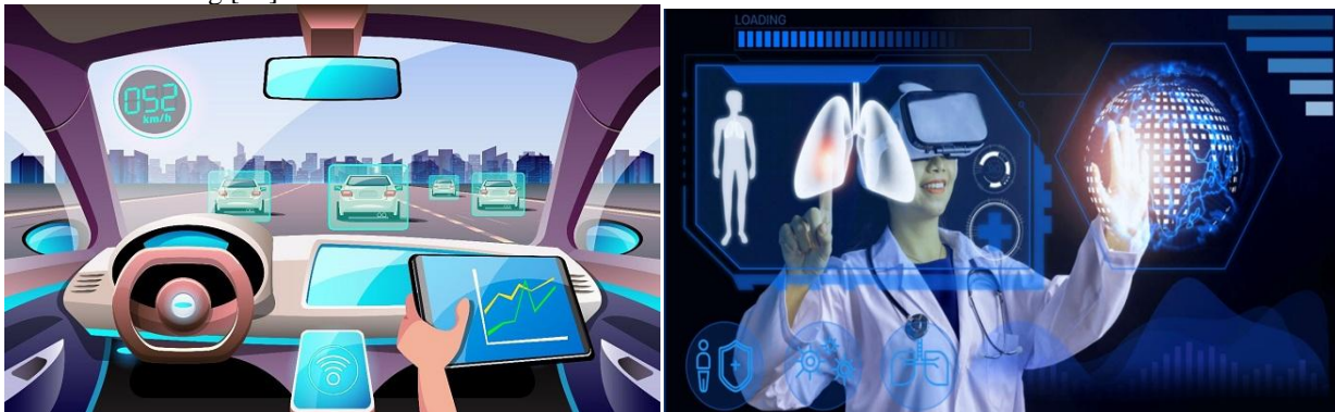
Figure 4: Benefit of AI in automobiles [68] and in healthcare [69]

Concurrently, the Internet of Things will have a substantial influence on other technologies, and a higher number of items will be connected to the Internet in the future. Now, the global number of active IoT devices exceeds 17 billion, and more than 85% of firms have improved their technical efficiency by integrating IoT technology into their products. As its impact on the daily lives of humans continues to expand, the IoTs has been referred to as ‘the next wave of innovation’. In the 21 st century, the IoT is essential for the functioning of large-scale corporations and service sectors. Furthermore, it has been proven that the IoT significantly impacts corporate operations management and decision-making [67].