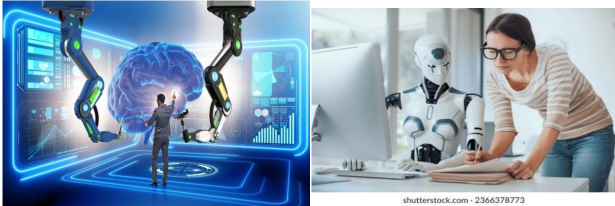
Figure 1: AI and the future of life and working relationship between human and robots [4, 55]

opportunities, particularly in areas like AI, robotics, biotechnology, smart shipping, smart transportation, smart healthcare, and data science, requiring a skilled workforce. The World Economic Forum declared that, 4IR technologies can play a vital role in addressing environmental challenges by promoting sustainable energy solutions, optimizing resource management, and reducing pollution [46]. A key aspect of 4IR is a human-centered approach, focusing on enhancing human well-being, preserving cultural heritage, and promoting social values [47].