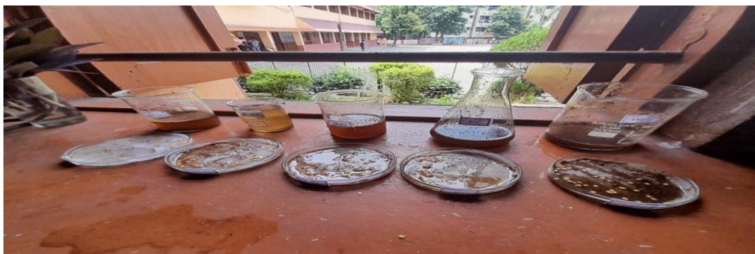
Figure: Treated seeds will be sown in different pots containing homogeneous soil to raise M1 plants.