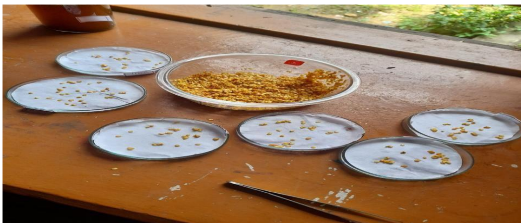
Figure: Seeds of Capsicum annum L. will be sown in distilled water only.

Experimental setup: Petri plates (9 cm diameter) were thoroughly washed with detergent and hot water to eliminate potential pathogens and contaminants. In each plate, 35 seeds of Capsicum annum L. were placed, and 6 ml of the test solution was applied. The control sets received 6 ml of distilled water. To maintain moisture, the respective concentrations were replenished as required, and all plates were prepared in duplicate. The experiment was conducted at room temperature ( 30 \pm 4 °C). Germination was monitored daily for three consecutive days.