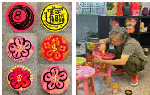
Figure 1: Artistic Re-decoration of Furniture Design

This approach employs surface art re-decoration to imbue discarded materials with renewed visual and cultural significance without altering their structure, constituting a form of surface visual reactivation within primary design. For instance, designer Li Yuyou utilised discarded benches as a medium, preserving their structure while applying the 'RICHFLOWER' motif. By integrating symbols with high-saturation colours, an urban aesthetic is cultivated. Such approaches achieve both material reuse and the infusion of cultural and aesthetic value into furniture. This straightforward methodology is applicable in educational, community, and exhibition settings, enhancing public awareness of sustainable design while fostering individuality and a sense of belonging.