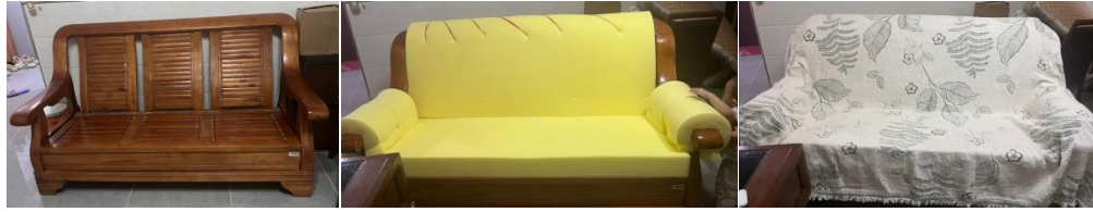
Figure 2 Functional Adaptation Furniture Design

optimisation of contact surfaces'. This approach suits households with limited resources while offering a sustainable upgrade path for ageing furniture.