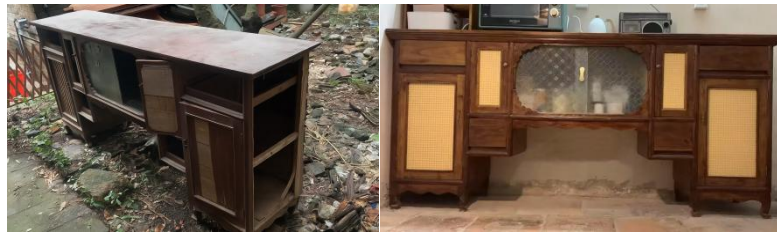
Figure 3 Structural Restoration and Functional Extension in Furniture Design

In Guangdong, a culture of salvaging and repurposing old items known as 'Stooping' is gradually gaining traction. Derived from the term 'Stoop', it refers to placing discarded furniture outside one's door for free collection, with those who gather and transform these items termed "Stoopers". This practice reflects young people's embrace of low-carbon, eco-conscious lifestyles and personalised living. Take the 'Magic Capsule Band' project, which repurposed an antique television cabinet, employing a strategy of 'structural restoration and functional extension': Preserving the solid wood frame, they sanded and reinforced it before applying a fresh coat of paint. Frosted glass panels were embedded, rattan doors fitted, and hardware replaced, transforming it into a kitchen cabinet that combines storage with decorative appeal. This approach, through partial restoration and functional upgrades, breathes new life and aesthetic value into old objects with minimal intervention. It proves particularly suited to household scenarios where resources are limited yet needs are diverse.