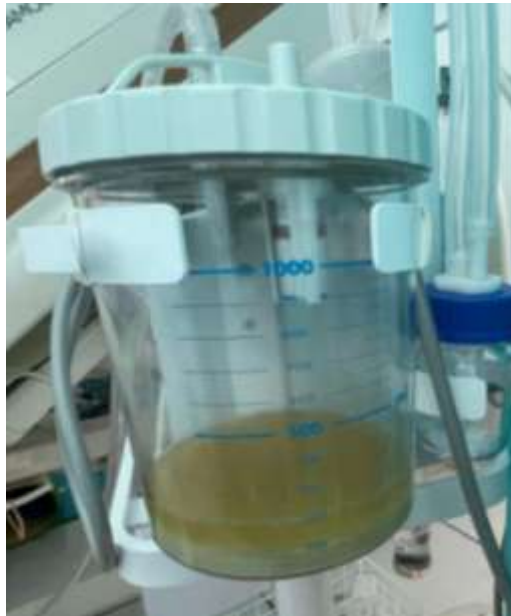
Figure 3. On day 7 of hospitalization pleural cavity produced fluid output of about 200mL

Bacterial culture from pleural fluid was taken on day two of hospitalization, showed of positive Klebsiella pneumoniae , when bacterial culture from sputum is carried out on day three of hospitalization, results that are similar to pleural fluid sample is also obtained, showed of positive Klebsiella pneumoniae . The strain was resistant to Ampicillin, Ciprofloxacin, and Nitrofurantoin. The patient was diagnosed with left pyopneumothorax associated with Klebsiella pneumoniae infection. In the emergency room, the patient underwent needle thoracocentesis by inserting a large-bore chest tube (LBCT) 24 French placed in the left pleural cavity produced fluid output of about 900mL on the first insertion, 200mL on the last day of hospitalization ( Figure 3 ). The following treatment are oxygen therapy with a simple mask 8L/min, NaCl 0.9% of 1000mL/day, Metronidazole 3x500 via infusion, Sansulin log G 10iu SC, Paracetamol 3x500mg inj., Omeprazole 1x40mg inj., Dexamethasone 3x8mg inj., Sucralfat syrup 3x1, N-Acetylcysteine 200mg/8 h was given for 7 days.