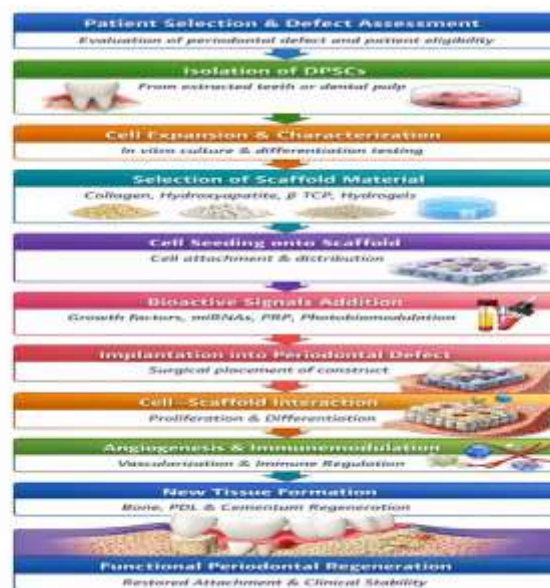
Fig.1 Workflow for DPSC-Based Periodontal Regeneration

Workflow illustrates the sequential steps from DPSC isolation to functional periodontal regeneration, highlighting the cell-scaffold-signal triad (Fig1and2).