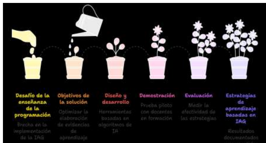
Figure 1. Methodological phases of the DSR approach applied in the research