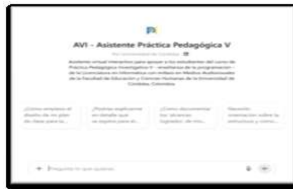
Figure 2. Custom GPT: Pedagogical Investigative Practice 5 (PPI5)

The tutor–practitioner interaction shifted toward pedagogical reflection, transcending merely formal corrections. The critical construction of reports and the redefinition of the teaching role were promoted. The results demonstrate the artifact's effectiveness in improving the quality of practice reports, optimizing feedback time, and strengthening student autonomy.