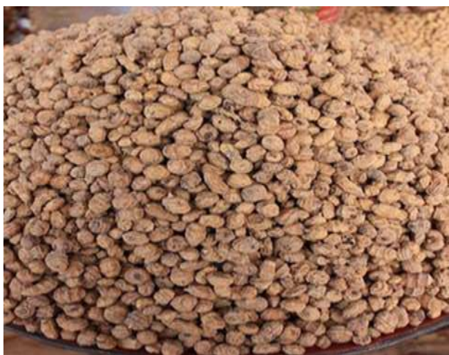
Figure 1 : Tiger nut tubers

The raw material (1 kg of dried tiger nuts) was cleaned with distilled water and then soaked in distilled water for 3 days. After soaking, the tubers were ground using a grinder containing 500 mL of water. The resulting powder was filtered through a white cloth. The milk was divided into five batches. The first four batches were pasteurized at 72 °C for 10, 15, 20, and 25 minutes, respectively. The fifth batch was not pasteurized. After pasteurization, the jars were cooled and stored in a refrigerator at 4 °C for subsequent analysis. Figure 2 shows the tiger nut milk production flowchart.