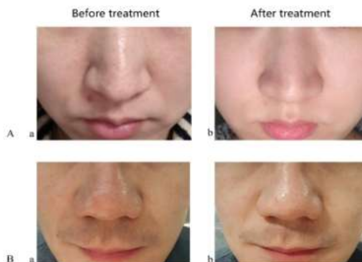
Figure 2. Representative facial images before and after treatment.

Figure 2 presents representative clinical images from two participants before treatment and after five applications. Visible improvements were observed in nasal alar pore enlargement, facial dark erythema, skin radiance, and nasal alar subcutaneous fat appearance.