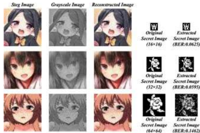
Fig. 3. Example of a figure caption.