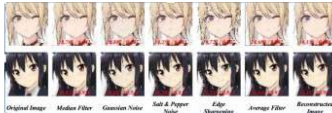
Fig. 2. Example of a figure caption.

Fig. 2. The comparison experimental results (visual quality, PSNR (Peak Signal to Noise Ratio) and SSIM (Structure Similarity Index Measure)) for the original images after being attacked and reconstruction (de-colorization and colorization operation). where Evgg19 represents the pre-trained VGG19 network, and the feature maps obtained from L3 = \text{Var}(\text{Ig}) \text{Var}(\text{It}) - 1 where the Var represents the mean values of local variation for an image. Therefore, the total grayscale loss function can be concluded as: L_{\text{Gray}} = 1L_1 + 2L_2 + 3L_3 where 1, 2 and 3 are the weight values that balance three losses. For grayscale images, contrast and content structure are more important than brightness. And inspired by Invertible Grayscale, 1, 2 and 3 are set to 1.0, 3.0 and 10, respectively. In conclusion, two loss functions are simultaneously utilized to optimize the de-colorized network and colorized network to obtain the grayscale image and reconstructed image. The parameters of networks can be optimized by minimizing the overall loss function as follows: L_{\text{total}} = L_{\text{MSE}} + L_{\text{Gray}}