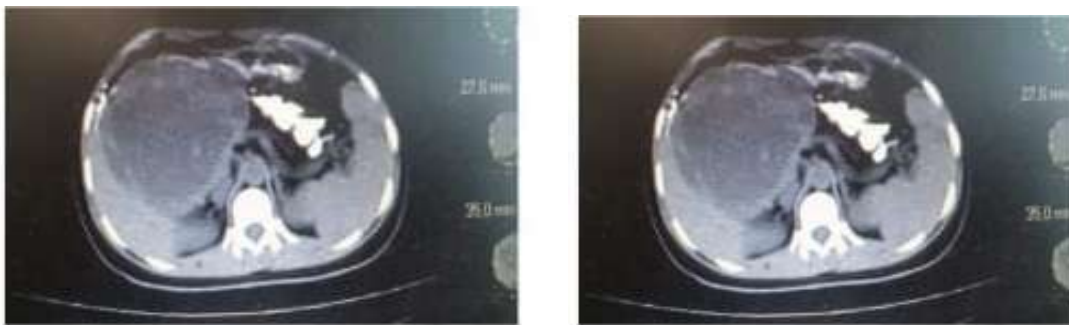
Figure 2: Abdominal CT. Cyst in the head of the pancreas.