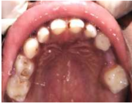
Digital design in CAD