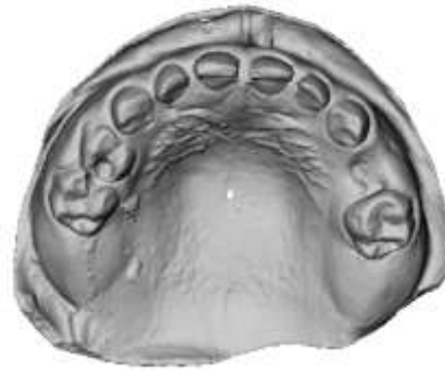
Intraoral scanning photograph