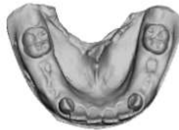
Intraoral scanning photograph