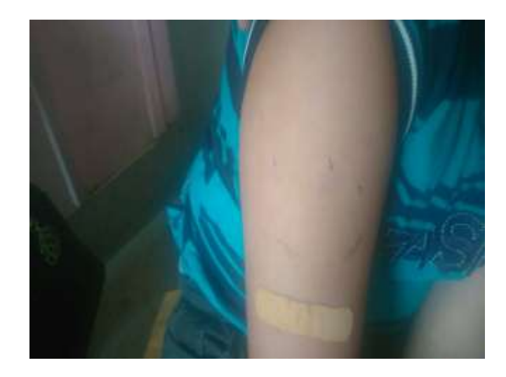
Figure:1(a) Figure:1(b) Figure: 1(a) shows ill-defined erythematous to bluish-grey plaque over right side of cheek, figure: 1(b) shows ill defined bluish-grey nodule over extensor aspect of right arm.

Patient was diagnosed as a case of lupus panniculitis. He was started on oral antibiotic, antihistaminic, topical steroid, moisturizer cream and advised him for baseline investigations, serological investigations, skin biopsy and Immunohistochemical study. Routine investigations -including complete blood count (CBC), random blood sugar (RBS), liver function tests(LFT), kidney function tests (KFT), thyroid profile, bleeding time (BT), clotting time (CT), activated partial thromboplastin time (aPTT), prothrombin time (PT), urine analysis, chest x-ray (PA view), ANA, Anti-ds DNA ECG, ultrasound abdomen, skin biopsy and Direct immunoflurescence test (DIF).