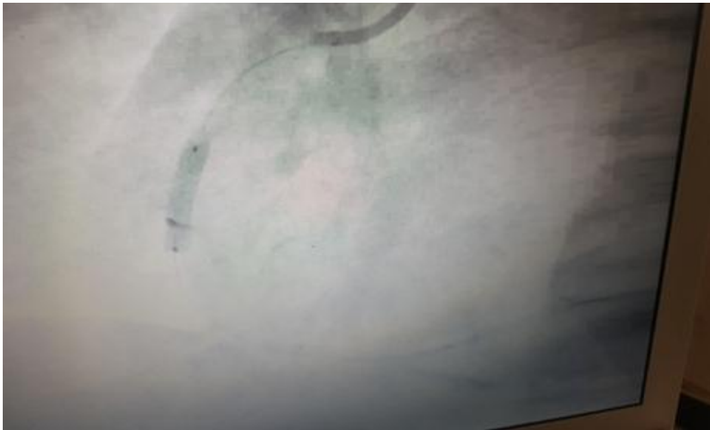
Illustration 3: Implementation of eluting stent (3x20mm)