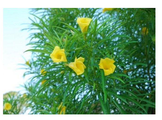
Fig 1:- Thevetia peruviana plant