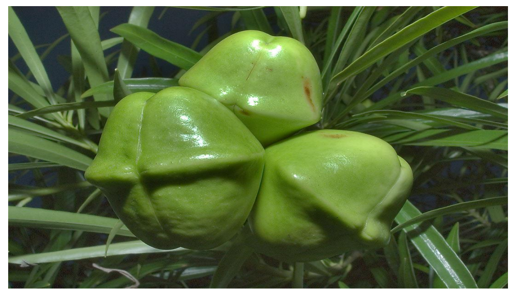
Fig3: Thevetia peruviana fruits

Cultivation and Propagation: Thevetia peruviana cultivation is not much hard. The plant succeeds in full sun or light shade, prefers a fertile, well-drained loam with additional leaf mould, though plants can succeed as well in poor and dry soils. The plant is also tolerant of moderately saline soils. Established plants are drought tolerant. The plants are shallow-rooted and should be sited in positions protected from strong winds. Stem tips of young plants are pinched out to encourage a bushy habit, and established specimens are pruned after flowering or shortly before the growing season to shape and restrict size. The plant can flower and fruit all year round in equatorial climates. The ripe fruits remain on the plant for a long time. The plant responds well to coppicing. Propagated by seed - it has a short viability and is best sown within 3 months of harvesting. Up to 80% germination rates can be expected.