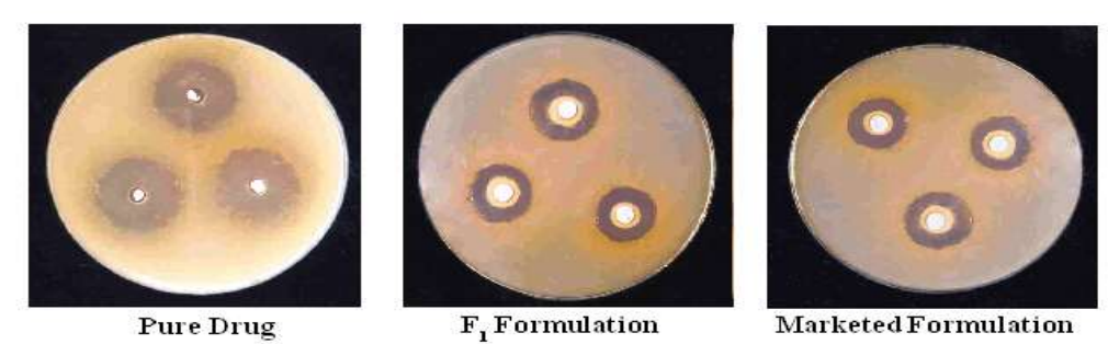
Figure-2: Comparative zone inhibition studies of drug in the formulations with pure drug and marketed formulation