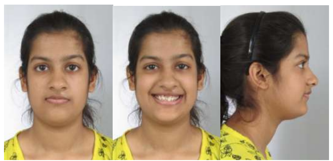
Fig 1:- (a), (b) and (c).

Class I molar relation was maintained bilaterally along with Class I canine relation on right side and Class I canine relation was achieved on the left side (Fig. 10 (a), (b), (c) and (d)).