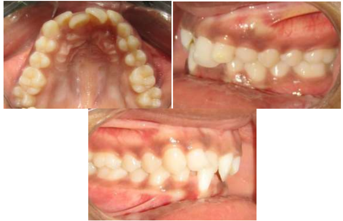
Fig 2:- (a), (b), (c), (d) and (e).