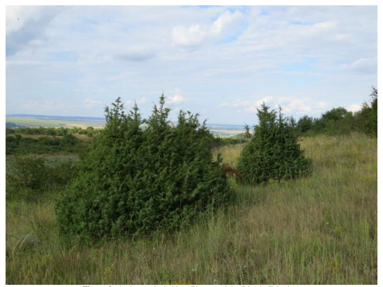
Figure 2:- A view at the habitat

The habitat borders on forest plantations of Pinusnigra J.F.Arnold. The floristic composition of the habitat occurs in the largest polygon (see Table in Appendix). In this habitat, were identified 78 species belonging to 70 genera and 28 families. Of these, 17 species are phanerophytes (Ph), 4 species are chamaephytes (Ch), 54 species are hemicryptophytes (H), 2 species are cryptophytes (Cr) and 1 species is a therophyte (Th). The majority of the species – 47 species (60.3%) have a projective cover less than 5% and the number of individuals over 50.