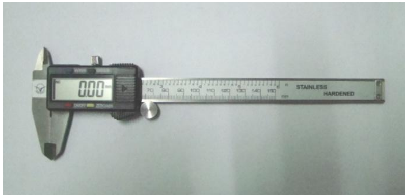
Fig 3. Digital Vernier Calliper (Indian Aeronautics Limited)

The M-D and B-L widths of all the erupted permanent teeth mesial to second molars were measured directly on plaster casts using a Digital Vernier Calliper (Fig 3). Teeth that were not fully erupted were excluded and measurements were not carried out where caries or restorations obscured one of the surfaces. Measurements were obtained on both sides of the dental arch.