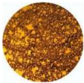
Figure 4:- Ferromagnetic particles in absence of an external magnetic field.

Figure 3:- Ferromagnetic particles under the influence of an external magnetic field.