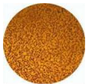
Figure 2:- Superparamagnetic particles under the absence of an external magnetic field, monodisperse particles distribution.