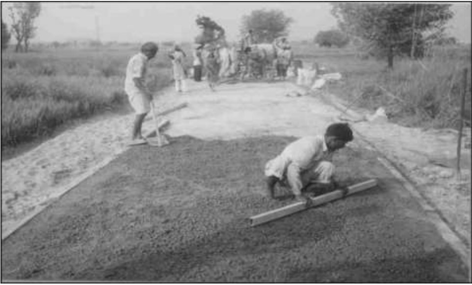
Figure 2:- Lime Stabilization Method

The amount of lime required for treatment varies between 2 to 10%. However, if the lime is used only to modify some of the physico-chemical characteristics of the soil, the amount of lime is about 1 to 3%. Figure 2 showing expansive soil treated by lime stabilization.