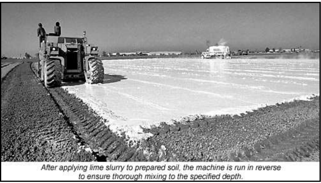
Figure 3:- Lime-treatment method