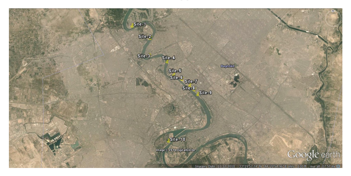
Figure 1: Sampling locations across Tigris River, Baghdad City

The study area (Tigris River within Baghdad city) (Figure 1) is located in the Mesopotamia alluvial plain between latitudes 33°14'-33°25' N and longitudes 44°31'-44°17' E. Tigris River is one of the most important twin rivers in Iraq, sharing with Euphrates River as the main sources for human use, especially for drinking water since they cross the major cities in the country. However, Tigris River is the source of drinking water for Baghdad city also used for the cultivation purpose. The river divides the city into a right (Karkh) and left (Risafa) sections with a flow direction from north to south. The area is characterized by arid to semi arid climate with dry hot summers and cold winters; the mean annual rainfall is about 151.8 mm [1].