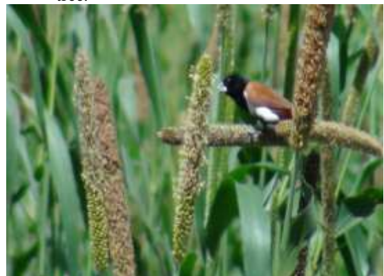
Fig 1f. Lonchura striata perching on matured spike of P. glaucum in crop field.