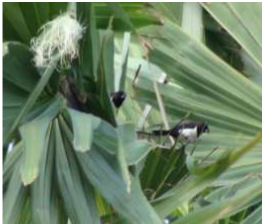
Fig 1c. Searching suitable nest of P. philippinus .