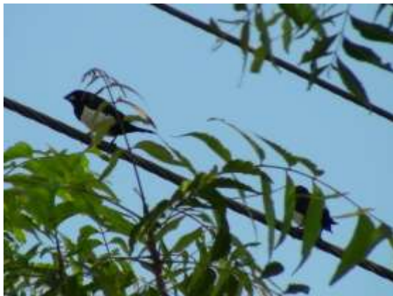
Fig 1e. Perching on electric power lines.