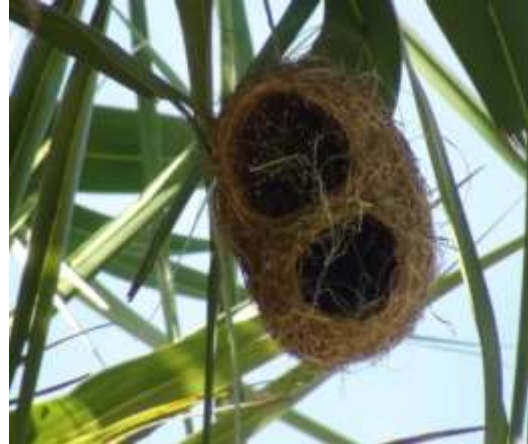
Fig 1b. Attempts of L. striata to plug the helmet stage nest of P. philippinus .