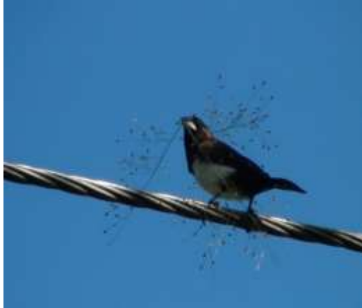
Fig 1a. Collection of nesting material by L. striata .