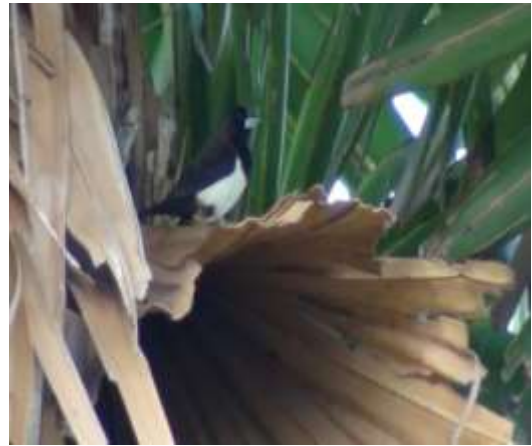
Fig 1d. Perching on nest-supporting tree.