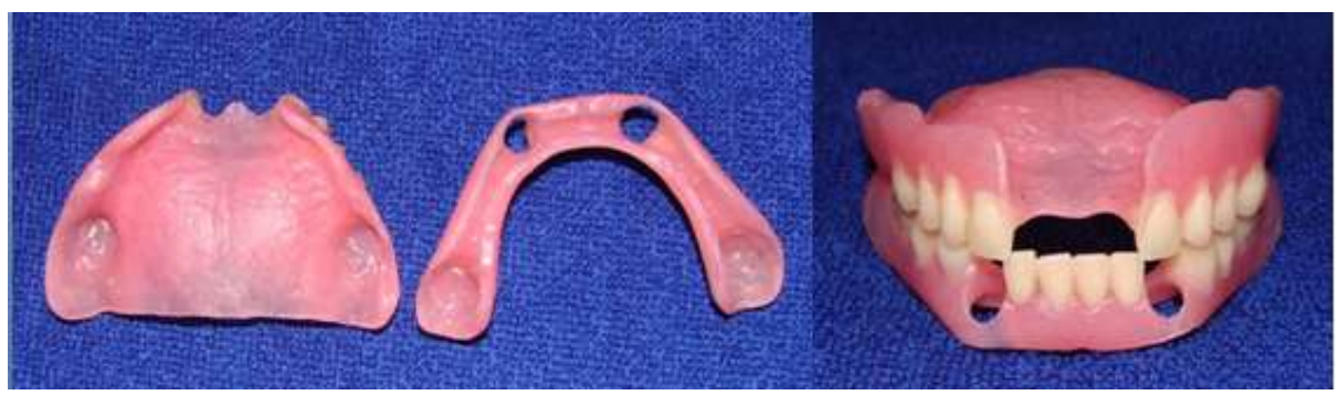
Fig.5:-Polished and finished Overdentures