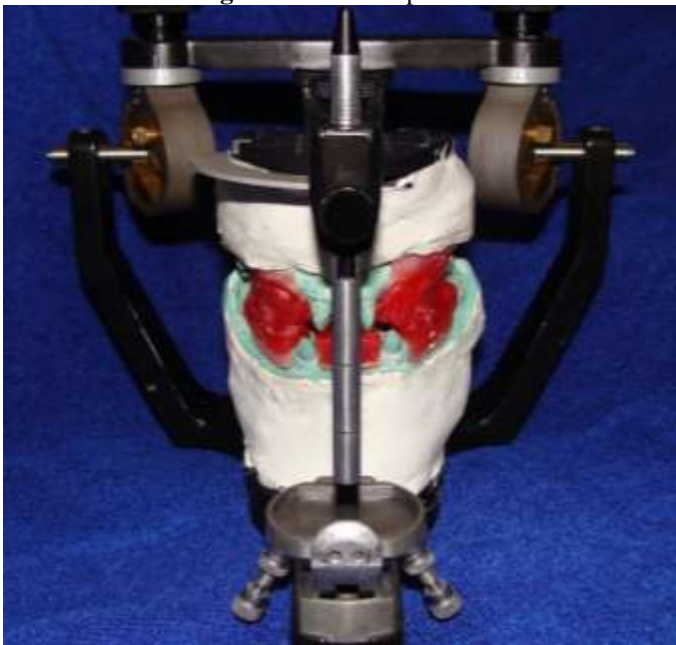
Fig.4:- Facebow transfer and Jaw relation