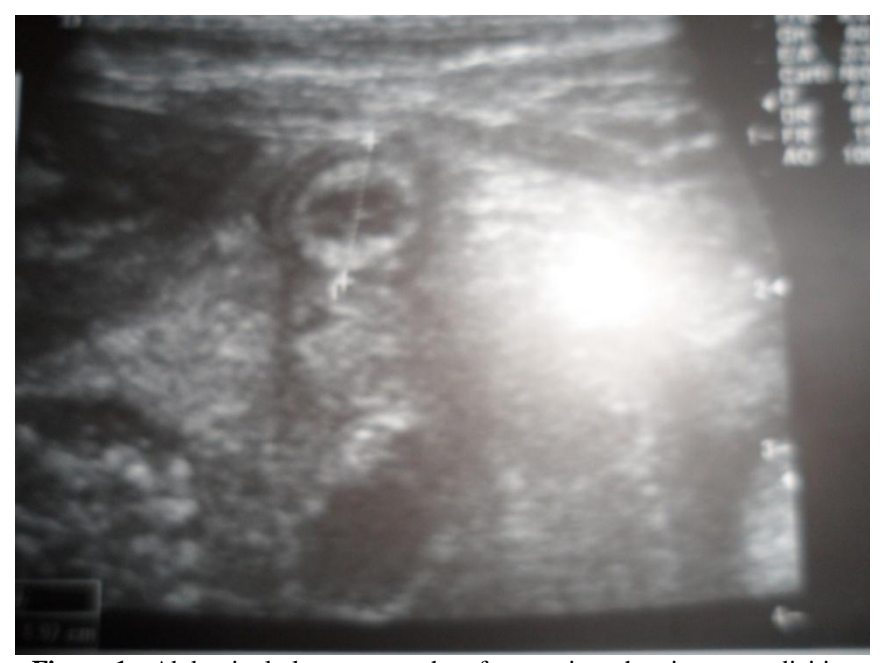
Figure 1:- Abdominal ultra sonography of our patient showing appendicitis.

day after his hospitalization, he had acute right iliac fossa pain. On examination, he was found to have a blood pressure of 120/80 mmHg, a pulse rate of 80 beats/min and a respiratory rate of 20 breaths/min; he was mildly pyrexial at 37.5°C. Abdominal examination revealed tenderness in the right iliac fossa. Laboratory investigations showed that the hemoglobin level was stable, but the white blood cell count was significant for a leukocyte count of 14,000/mm3 with 80% polymorphonuclear leukocytes. Then, abdominal US showed acute appendicitis (Figure 1). An emergency operation was performed. At laparotomy, a right paracolic retroperitoneal hematoma was detected. The patient had pelvic appendix in position. The appendix was hyperemic and edematous. Hematomas of the caecal wall and of the appendiceal wall were found (Figure 2). Appendectomy was performed. Histopathology confirmed diagnosis of acute appendicitis. Our patient made an excellent recovery, and he was discharged from the hospital in stable condition 2 days later.