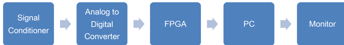
Figure 1: Block Diagram of Digital Oscilloscope based on Computer.

A new type of oscilloscope is emerging that consists of a specialized signal acquisition board which can be an external USB port device. The user interface and signal processing software runs on the user's personal computer.