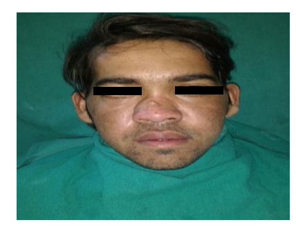
Fig 3:-Preoperative frontal view

We propose that this approach can be consistently used by Maxillofacial surgeons for refracturing malunited sites and anatomic reduction of refractured nasal bone. It can also be used for performing simultaneous septorhinoplasty which is often required for correcting nasal deformities.