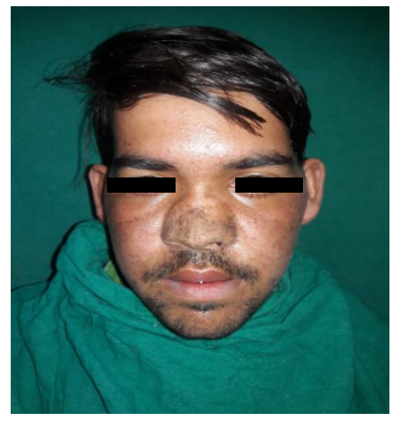
Fig 6:- 1 month postoperative photograph