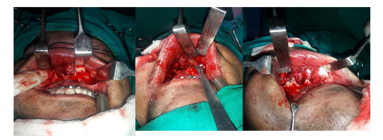
Fig 5:-Intraoperative photographs