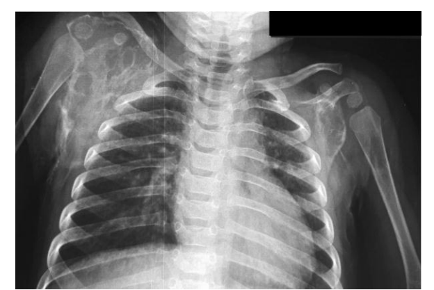
Figure1:-multiples osteolytic lesions in both scapula and left humerus.

Langerhans cell histiocytosis (LCH) is a rare disorder, mostly affecting children. The scapula is uncommonly affected in young children. Imaging specially MRI is presently the most informative imaging tool in the management of bone LCH.