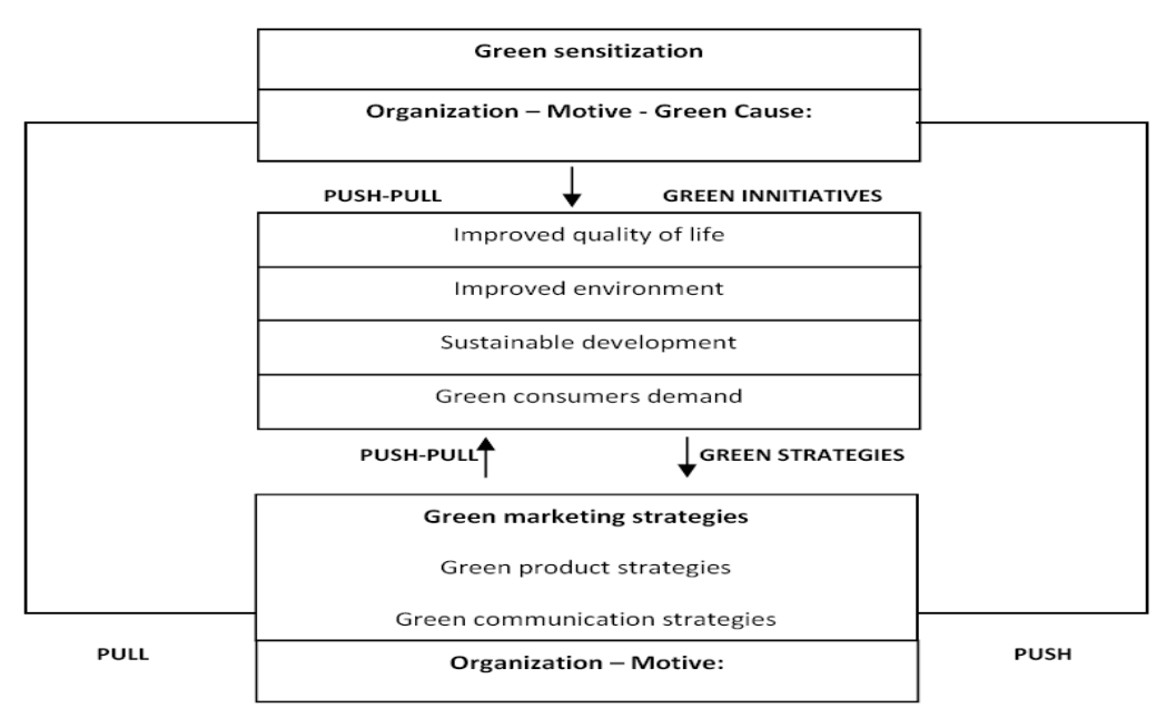
Figure 1:- The green marketing transformation and the push-pull effects.

Each company must play a dual role, of an organization with a social reason on one hand and as a business with a gain motive thinks [3]. These two aims, social and profit, are antagonistic and for the business would be complicated to project it as performing both. For succeeding, the company should play the role of a promoter of a particular cause with the purpose of education and sensitizing the consumer about the particular issue and determining the requirements of consumers. Both aims are legal for the green companies, too. A green company should be a green cause promoter and determine the emergencies of already and powerful green consumers. This technique could be called the green push –pull initiative and it can offer severe input to the company with the profit purpose. The objective becomes a support for the growth of the green marketing that best satisfy the green consumers' requirements and it could be known as the green push-pull strategy.