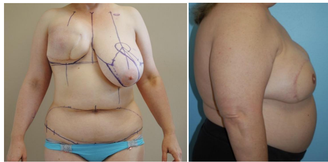
For this patient pre-operative once we compare for the left pic. Showing the scar and deformity of the breast. All this depend on the reconstruction of the breast and the prognosis.