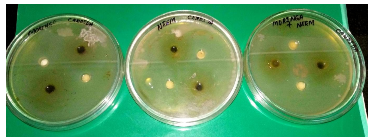
Figure 4:- Zone of inhibition (in mm) M.oleifera+C.albicans, A.indica+C.albicans, M.oleifera+A.indica+C.albicans