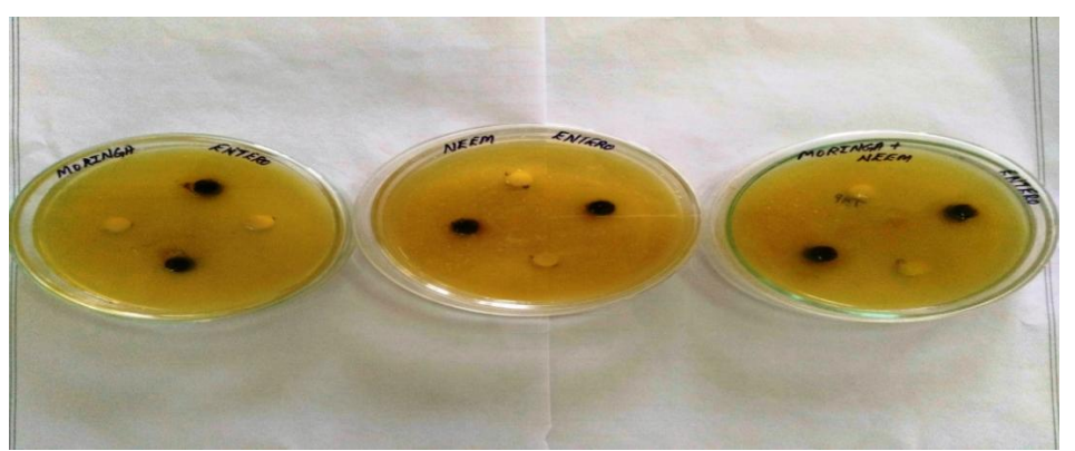
Figure 2:- Antimicrobial activity (Prepared plates) M.oleifera+E.faecalis,A.indica+E.faecalis,M.oleifera+A.indica+E.faecalis

Then, the plates were incubated at 35-37°C for 24 hours (figure 2 and figure 3). After the incubation period, the antimicrobial activity was evaluated by determining the zone of inhibition (mm) around each well of extract solution.