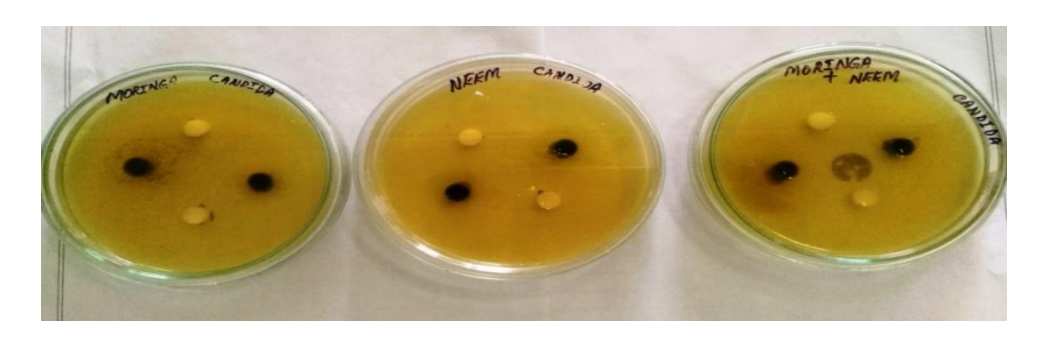
Figure 3 :-Antifungal activity (Prepared plates) M.oleifera+C.albicans, Aindica+C.albicans, M.oleifera+A.indica + C.albicans