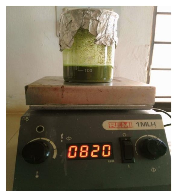
Figure 1:-Extract of moringa leaves preparatory procedure)

50g of moringa oleifera leaves powder was soaked in about 250ml of ethanol (95%) for 48 hours at room temperature. The soaked mixture was then magnetically stirred (REMI 1MLH) at 800rpm for 4 hours to obtain a homogenous mixture and then stored at 4°C for 24 hours to allow the extraction of active constituents .Extracts were then filtered off using Whatman No.1 filter paper and concentrated by using rotary flash evaporator (Superfit Rotary Vacuuma Digital Bath) at controlled temperature (figure 1)