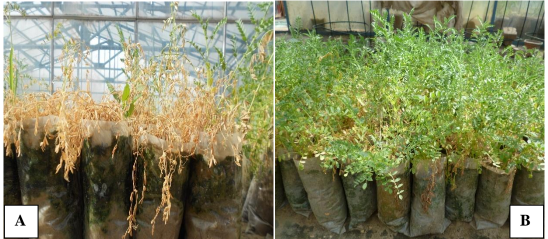
Plate 2:= Wilted chickpea plants (dry, brown and drooped) (A) vs Non-wilted plants (fresh and green) (B)