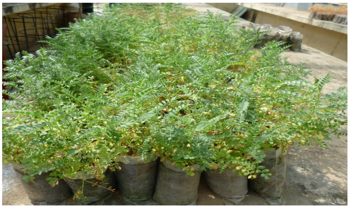
Plate 1:- Pot culture experiment conducted under glass house conditions variety (GPF-2)