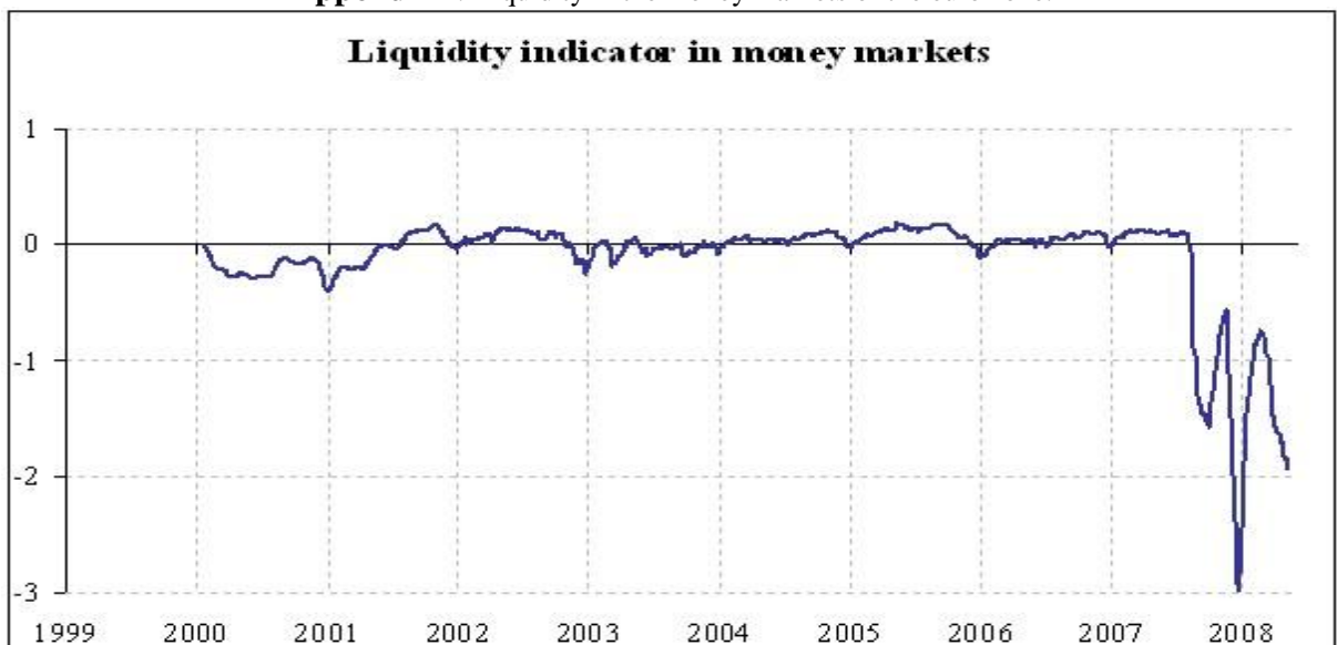
Appendix 1 :-Liquidity in the money markets of the euro zone.

Source: European central bank. Working Paper Series, no 1\,0\,0\,8 / February 2009 Liquidity (risk). Concepts definitions and interactions. By Kleopatra Nikolao