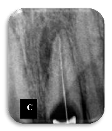
Fig C:- Radiographic verification of working length