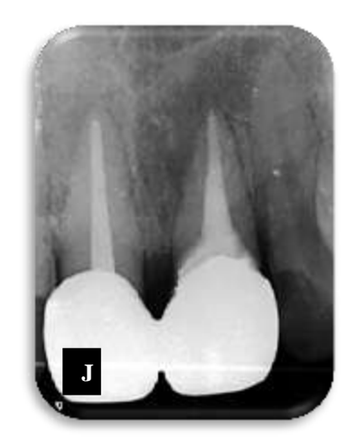
Fig J:- Six month follow up radioograph