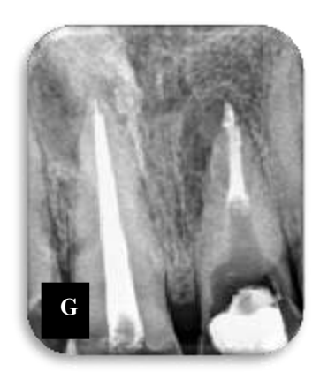
Fig F:- Removal of metapex from 21 after 1 month. Radiograph showed reduction in periapical radiolucency. Fig G:- Obturation i.r.t. 11 and Apical plug of MTA i.r.t. 21

The temporary filling material and paper point was removed after two days and the set of the MTA was gently tested. The rest of the canal was obturated with warm vertical compaction of gutta-percha in association with a root canal sealer sealapex till the resorptive defect. As there wasn't any perforation or communication between canal dentine and periodontium, defect was filled with hybrid composite. Both teeth 11 and 21 were prosthetically rehabilitated with ultra-T Zirconia Crowns.