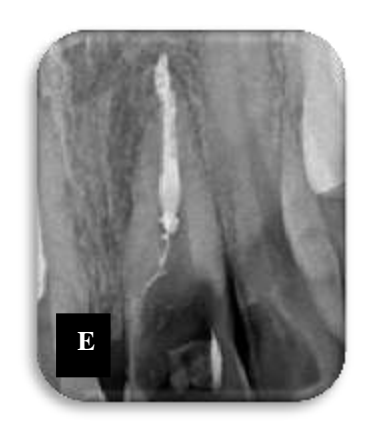
Fig E:- Metapex was placed in canal

After 7 days, the dressing material was removed with 3% sodium hypochlorite, followed by normal saline irrigation and aspiration. After the canal was dried, metapex syringe was inserted into canal and material was injected in canal. The completed root canal filling with metapex was verified radiographically.