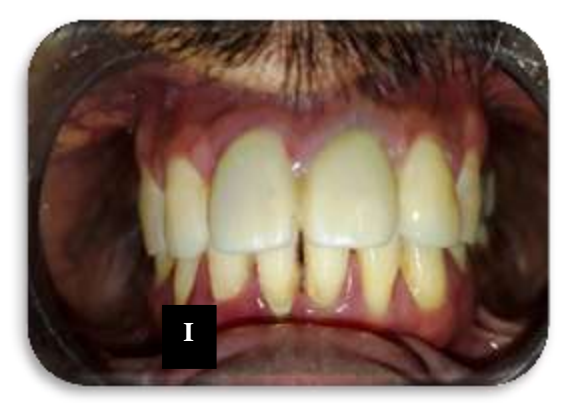
Fig H:- Obturation with warm vertical compaction and resorptive defect filled with hybrid composite i.r.t. 21. Fig I:- Post Operative photograph after FCC i.r.t. 11, 21.

A six-month follow up demonstrated clinically asymptomatic and adequately functional tooth, with radiographic signs of healing.