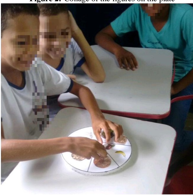
Figure 2:- Collage of the figures on the plate