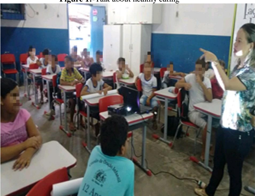
Figure 1:-Talk about healthy eating

The study was carried out through authorization through the Written Informed Consent Form (WICF) for minors under 18, resolution 466/12. The nutritional education activity was developed with 30 students from the 5th year of elementary school I, presenting a mean age of 10 years. Prior to the nutritional education activity, students attended a class on healthy eating (Figure 1).